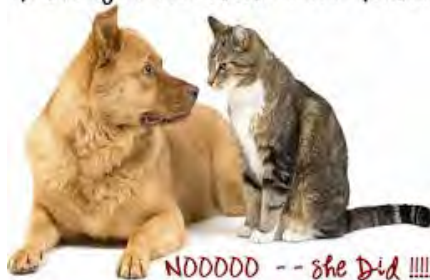
NOOOOO -- she Did !!!!!

He brought the fleas in the house!!! Fleas love winter. Why? Because their eggs love a warm house to hatch in!